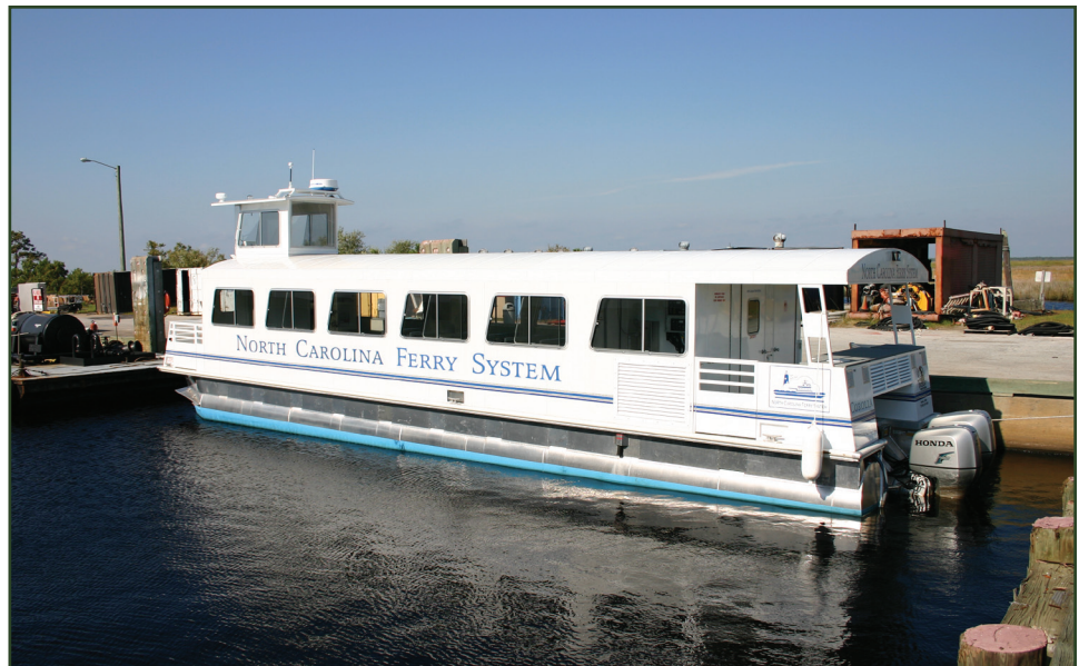
The pontoon boat that the N.C. Department of Transportation purchased for the Currituck Ferry Route has never been used.

In 2002, the Currituck County Board of Commissioners sought Senate President Pro Tem Bas-