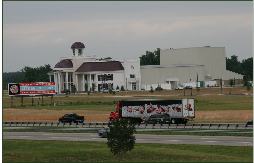
The Randy Parton Theatre (now the Roanoke Rapids Theatre) as seen from across Interstate 95.