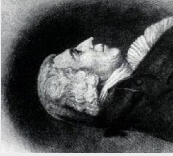
Richard Dobbs Spaight

5. Why did Spaight change political parties?